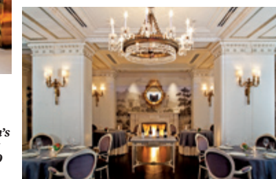
The Jefferson's restaurant offers 1,200 wines

21C The Jefferson's lobby display of the founding father's documents is interesting—but not as cool as the Chuck Close and David Hockney pieces at the 21C.