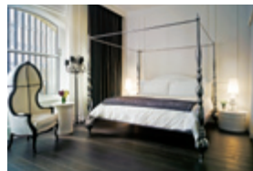
A Nicoletti Italia "Celebrity Bed" at the Ames

The Surrey The Ames' apartment suite has Korres products for bathroom pampering. But the Surrey stocks Italian cotton Pratesi bathrobes—for pets.