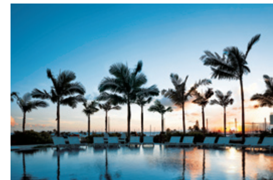
The Edition offers guests poolside iPads