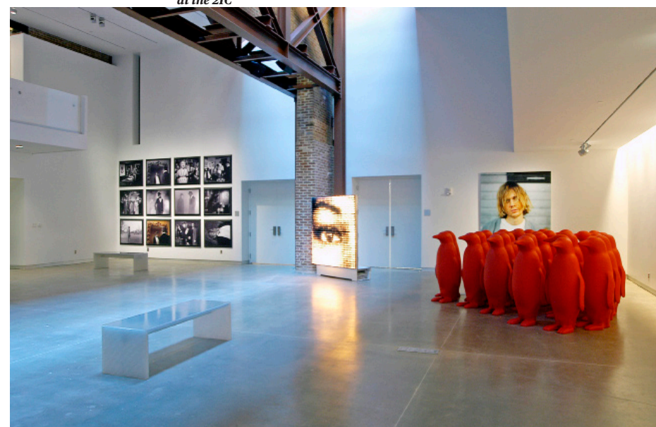
Exhibitions rotate every six months at the 21C

21C The height of boutiquey-ness is exemplified in the 21C's waterfall urinal that doubles as a one-way mirror into the lobby. And its 42 four-foot-tall recycled-plastic penguins, which were shown at the 2005 Venice Biennale. Their current purpose remains unclear.