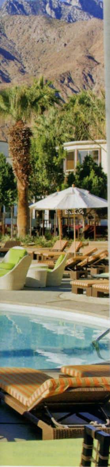
CLOCKWISE FROM LEFT: Riviera Resort & Spa; Parker Palm Springs; Ace Hotel & Swim Club