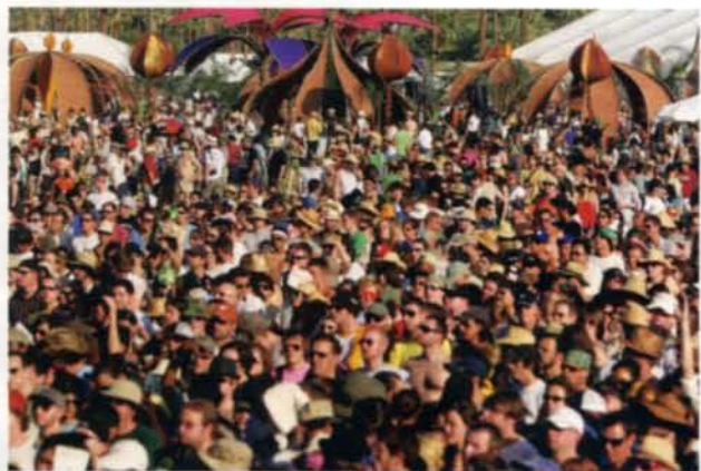
FROM ABOVE: Desert Springs JW Marriott Resort & Spa's golf course; Parker Yacht Club spa in Palm Springs; the crowd at Coachella Valley Music and Arts Festival. LEFT: A newly remodeled home at Bighorn Golf Club